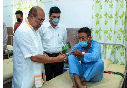
CM N. Biren Singh visiting injured landslide victim

Mortal remains of seven personnel of Territorial Army were sent to respective home stations by IAF aircraft and an Indian Army helicopter to Kolkata, Bagdogra and Agartala. They were paid full military honors by GOC Red Shield Division and IG IGAR (South) at Imphal in the morning today. Similar befitting honors will be paid at respective home stations as well.