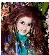
By: Shahnaz Husain

It is that time of the year again when there is a nonstop downpour. breezy winds and splashy water everywhere. It is a common perception that monsoon has a gloomy face.