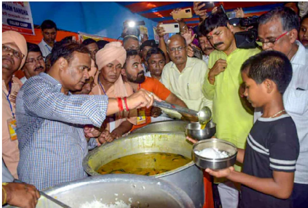
Assam Chief Minister Himanta Biswa Sarma serves food to residents of flood-affected areas, at a relief camp in Silchar.