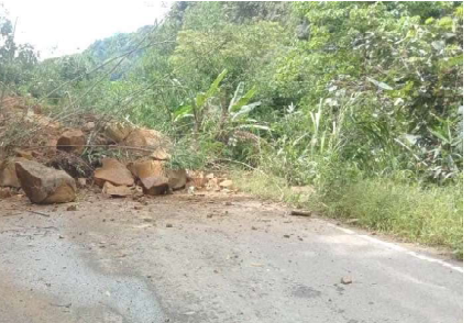
Landslide occurring at NH-37 tweeted by CM N. Biren Singh