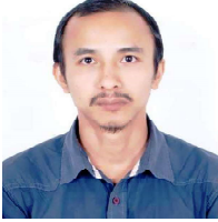
IT News Imphal, July 03: